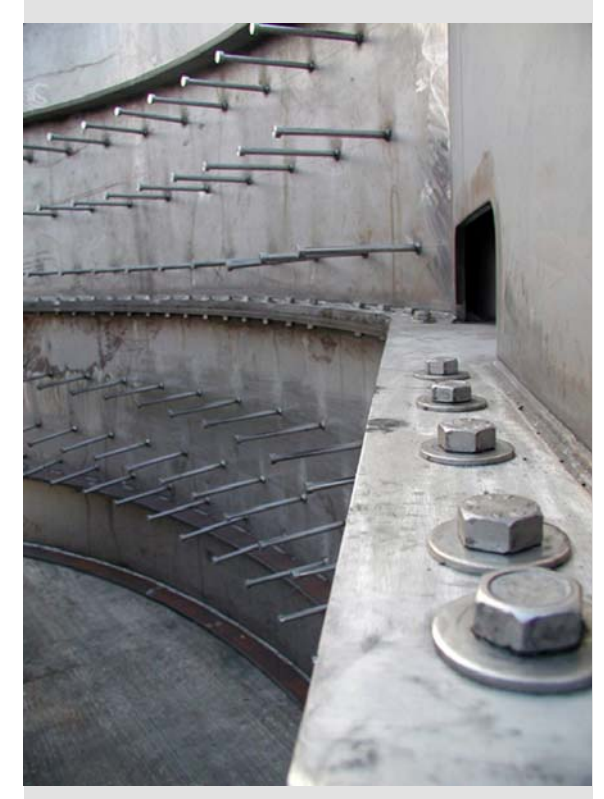
Figure 6: Edge flange connection

To facilitate lifting, each stainless steel skin segment was fabricated in two halves, with 25 mm thick stiffening flanges and 25 mm thick intermediate stiffening rings. High strength friction grip bolts of 22 mm diameter in duplex stainless steel were used for the vertical splices. The contact surface of the connecting plates required treatment to ensure that the coefficient of friction was greater than 0.2. The bolts were preloaded to achieve a shank tension of 165 kN. No slip was allowed at serviceability but slip was allowed at the ultimate limit state, with the remaining applied loads resisted in bearing.