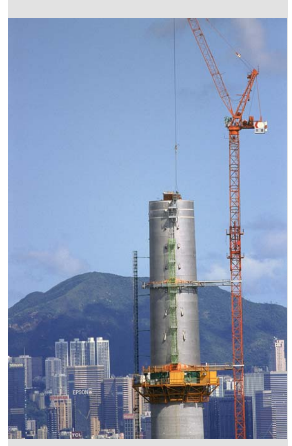
Figure 7: Installation of stainless steel skin segments

Welding: Guidance from IMOA on welding duplex stainless steels was adopted [4]. The consumables used for arc welding of stainless steel were chosen to ensure that the mechanical properties and corrosion resistance of the weld metal was not less than the parent metal requirements. Welders were qualified in accordance with EN 287 [5] and the welding procedures were in accordance with current European standards. Weld areas were bead blasted to maintain the uniform surface finish.