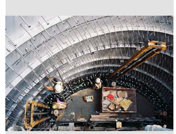
Figure 5: Shear connectors on the inside of a tower segment