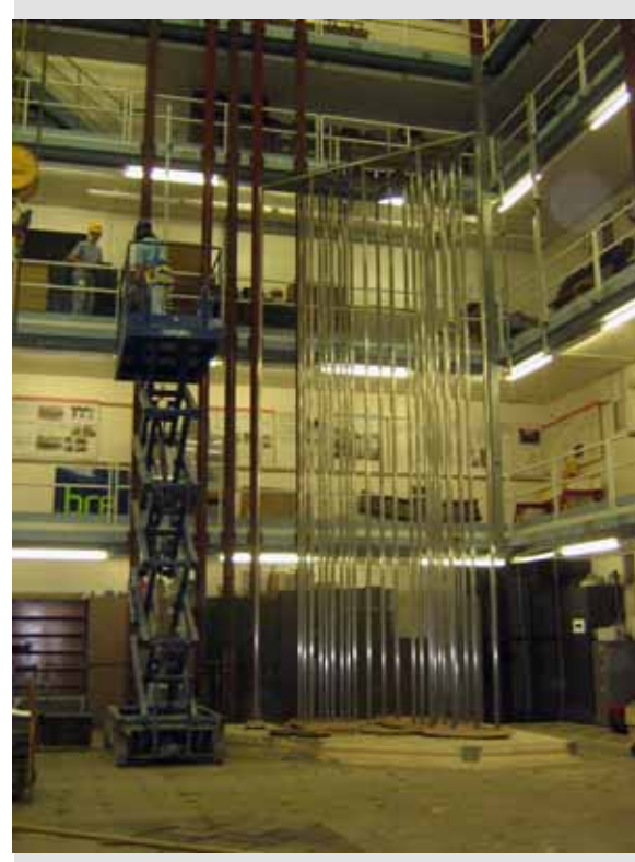
Figure 5: Mock-up of part of the pavilion at BRE