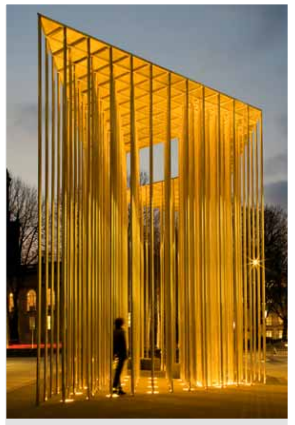
Figure 1: The Pavilion, Regent's Place, illuminated

The unusually high column slenderness was only possible by a design approach developed from first principles which involved establishing projectspecific loading, deflection and acceleration criteria.