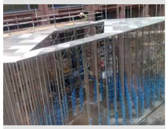
Figure 8: Pavilion under construction

An adhesive plastic protective coating was applied along the length of the columns to protect them during transportation and erection [4]. Following completion of construction, a number of scratches to the column surface were evident at high level. A polisher was adapted such that it would automatically run up and down the height of the columns and remove any visible defects. This purpose-built machine was dubbed the "rat up a drain pipe" and ensured the full beauty of the elegant, impossibly slender columns was achieved.