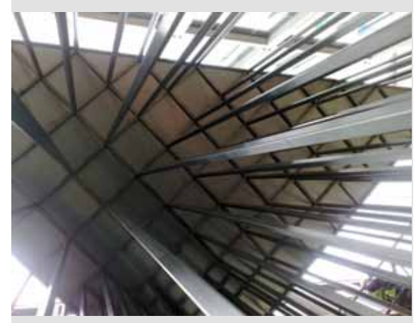
Figure 4: View of underside of roof