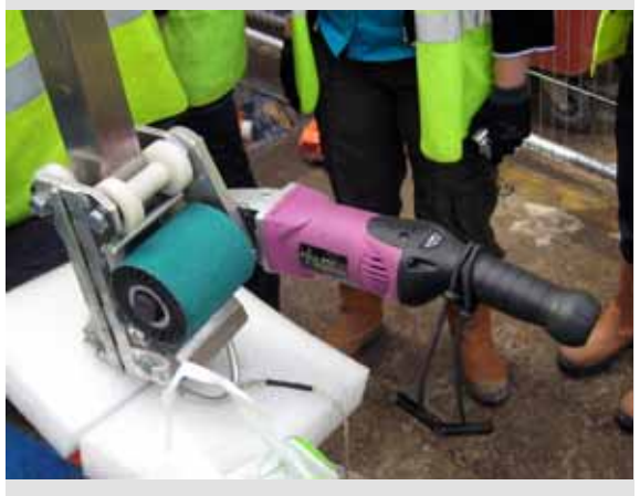
Figure 9: On-site polisher ("Rat up a drain-pipe")