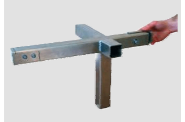
Figure 3: Mock-up of roof connection