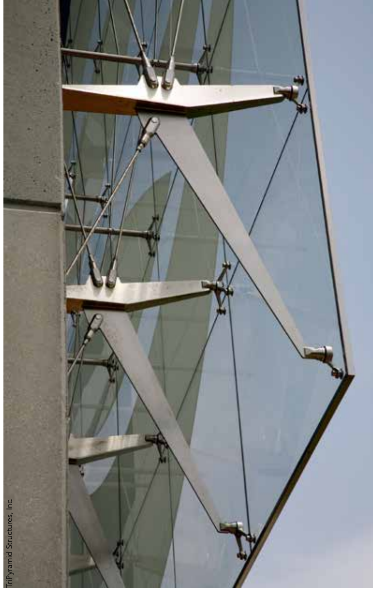
A stainless steel sign support in Tampa, Fla.