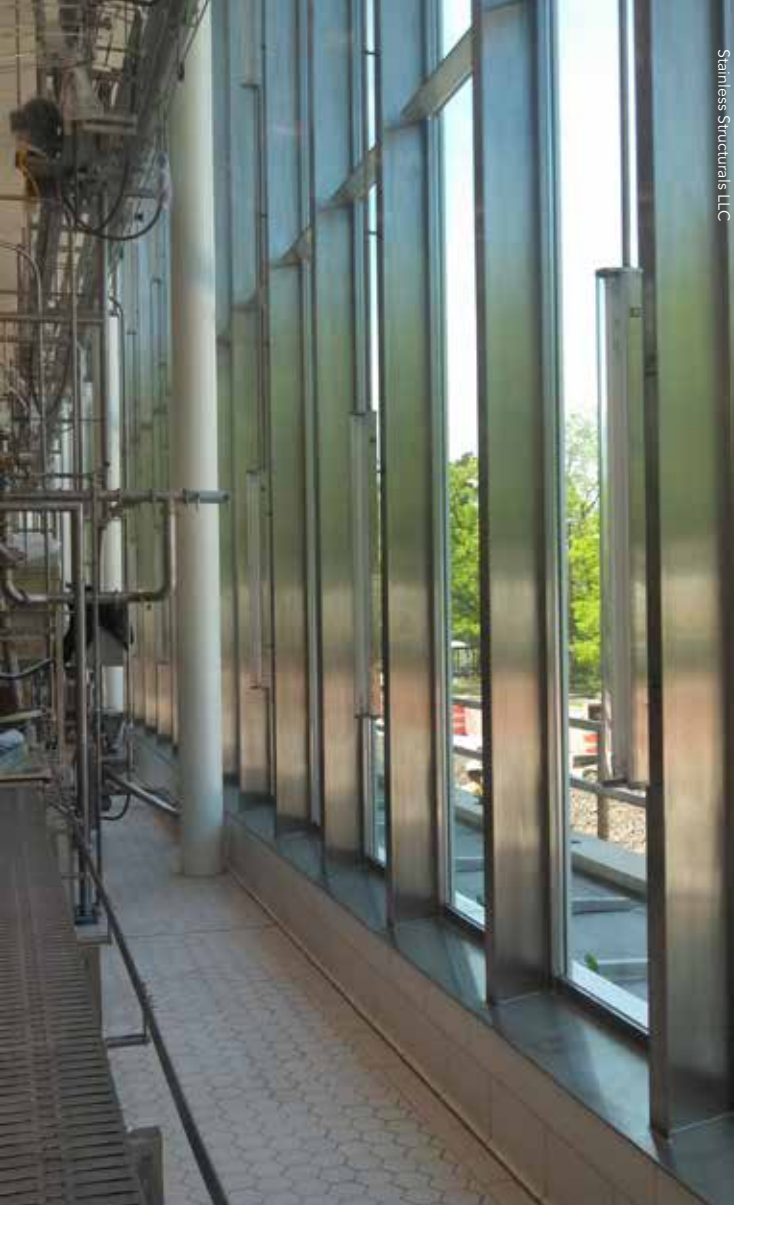
Stainless steel columns at Cornell University's College of Agriculture and Life Sciences.