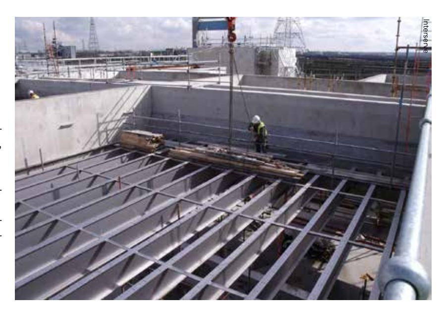
▲ Stainless steel beams at Thames Gateway Water Treatment Works.

Stainless steel HSS used for the entrance canopy in Seven World Trade Center. The cable net wall incorporates tensioned high-strength stainless steel cables to support the façade.